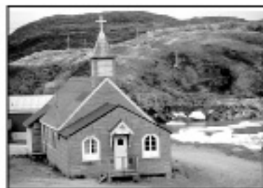
KIMMIRUT - EST. 1909

Day 9: (7/14, 7/28) Iqaluit. Morning available for touring and shopping in town. Early afternoon flight to Ottawa, arriving approximately 5P.M. (Later flights occasionally scheduled). Most people opt to stay in Ottawa (at the Southway) upon their return.