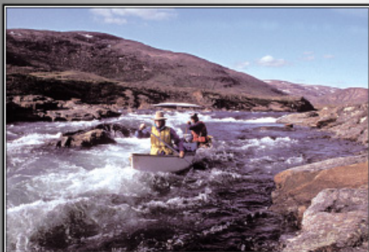
CLASS II WHITEWATER

As we approach the coast, and Soper Falls, we link up with local Inuit guides who escort us into the small, native community of KIMMIRUT , (formerly Lake Harbour.) This historic, traditional community has greeted whalers, missionaries, and traders since the 1860's, and is renowned for its intense soapstone carvings. Offshore excursions, among icebergs and polar bears, are optional.